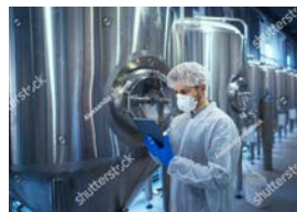
Contaminated Product Insurance

We pride ourselves on building long-term client relationships by providing comprehensive value, quick turnaround times and excellent service to our global client base that spans multinational manufacturers, distributors, assemblers, and wholesalers involved in the supply chain. AIG Talbot brings in-depth insights and leverages our experience across a wide range of industries, including: