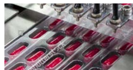
Topical & Consumer Health