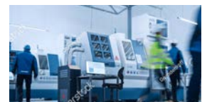
Component part manufacturers