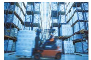
Product Recall Insurance