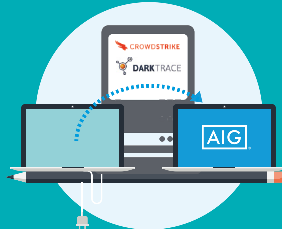
Current partners include CrowdStrike® and Darktrace®, with other partners to be available soon.

We then use that data to regularly update the client's cyber maturity profile throughout the policy period.